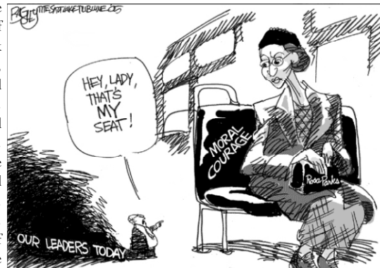
Editorial Cartoons from the Nation's Newspapers

Thinking of Rosa Parks and the life she led brings me to people who have shaped my life in a positive way. We all have people in our lives that give us direction, take stands for us, and become our rock. Most of the time, it is in passing through